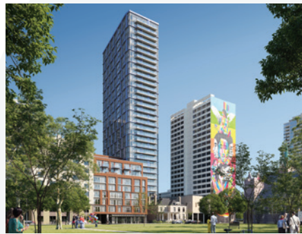
JAC CONDOS TORONTO