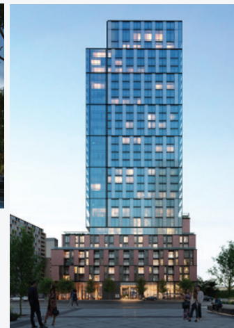
THE GOODE TORONTO