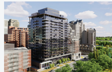
FIRST & PARK CALGARY