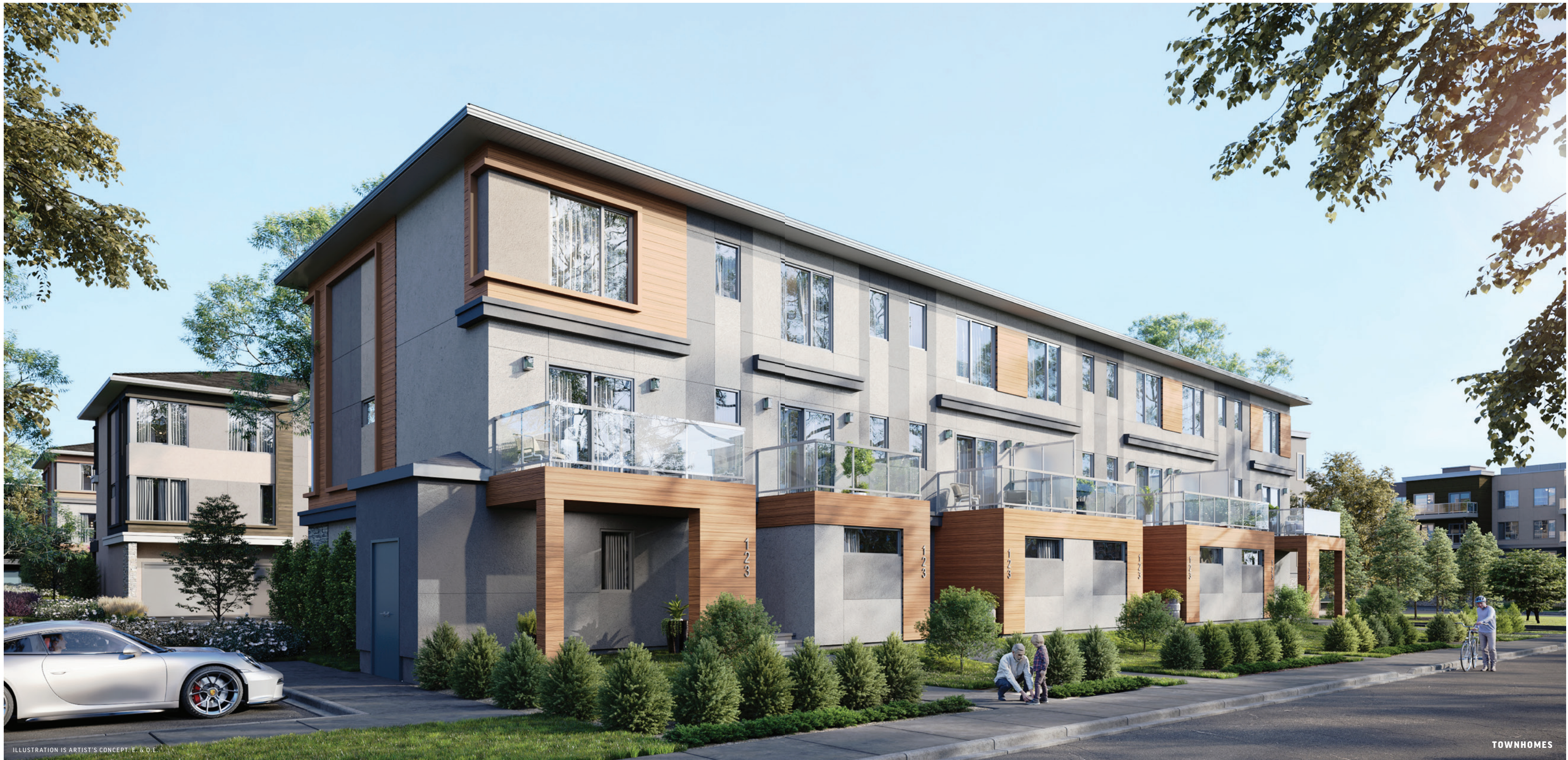
ILLUSTRATION IS ARTIST'S CONCEPT. E. & O.E.