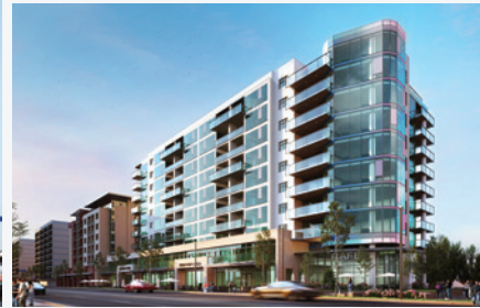
THE THEODORE CALGARY