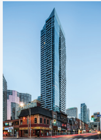
FIVE ST JOSEPH TORONTO