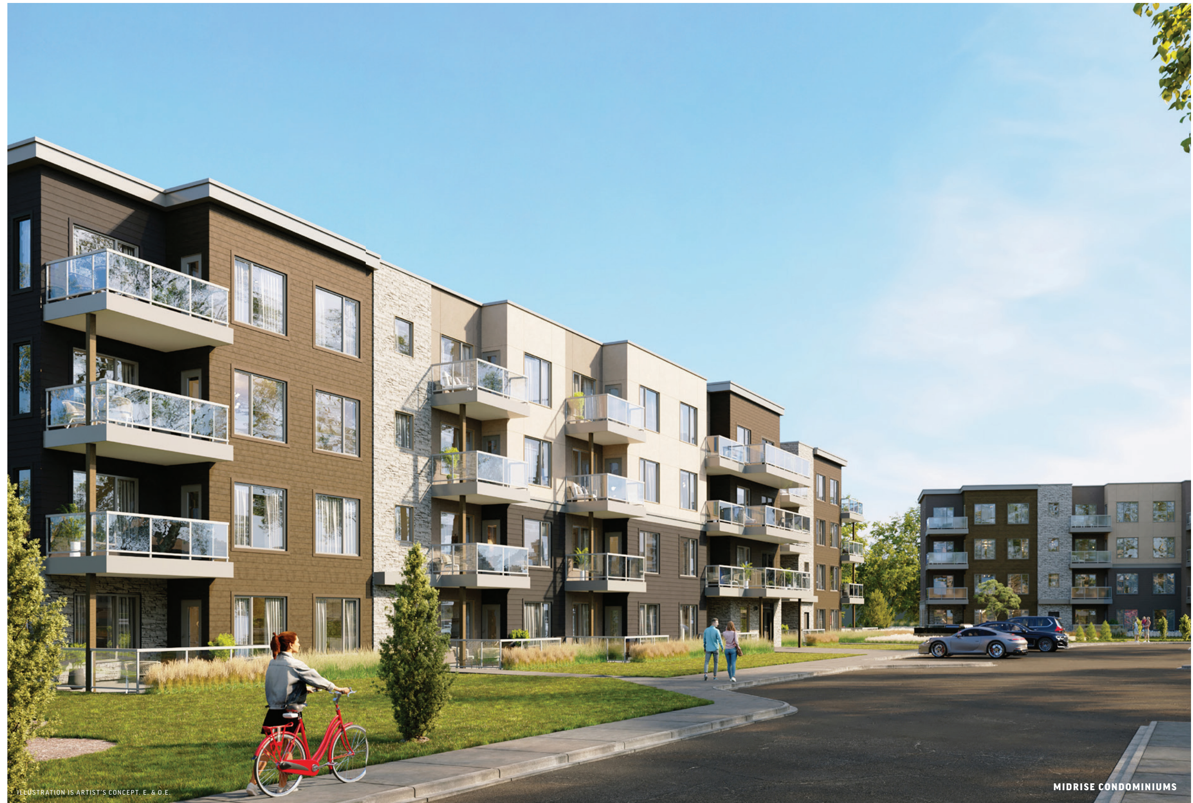
ILLUSTRATION IS ARTIST'S CONCEPT. E. & O.E.

Thoughtfully designed to complement a variety of lifestyle needs, from expanding families, downsizers, city dwellers who love nature, and nature lovers working downtown. The modern West Coast-inspired architecture features clean lines, natural materials, large windows, and balconies or decks to keep you connected to the great outdoors.