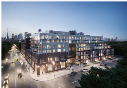
WONDER CONDOS & LOFTS TORONTO