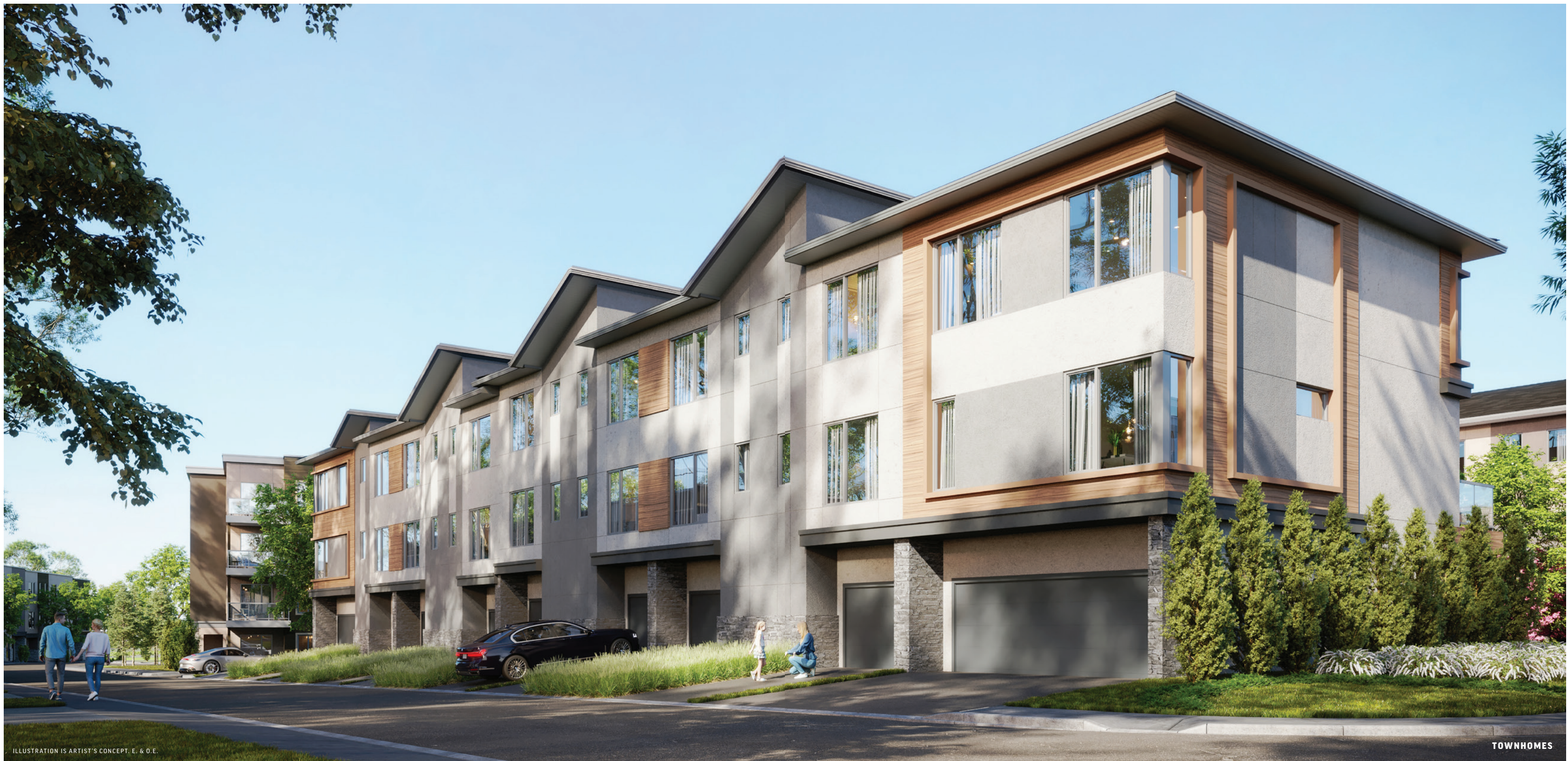
ILLUSTRATION IS ARTIST'S CONCEPT. E. & O.E.