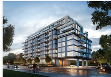
250 LAWRENCE TORONTO